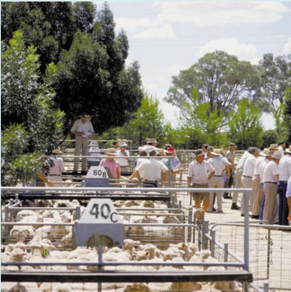
Social Justice Sunday 2001

The principle of solidarity asserts that the human person is social by nature. This social dimension is part and parcel of our humanity. Any reflections on humanity must take